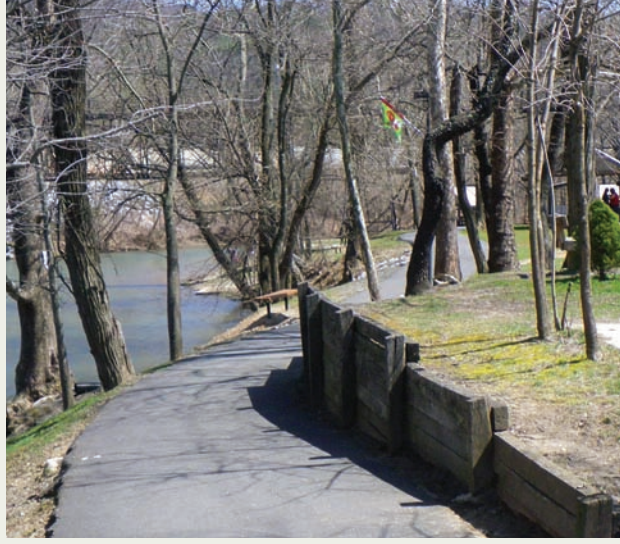
Spruce Pine improved access to its trout waters by developing trails and greenways like this one at Riverside Park.