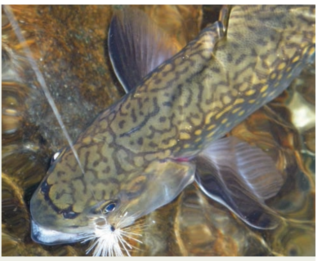
Trout anglers fishing in North Carolina in 2008 spent $146 million on trips and equipment and generated a total economic output that exceeded $174 million. Communities can promote tourism by partnering with the Wildlife Resources Commission to create, maintain and enhance trout fishing opportunities throughout western North Carolina.