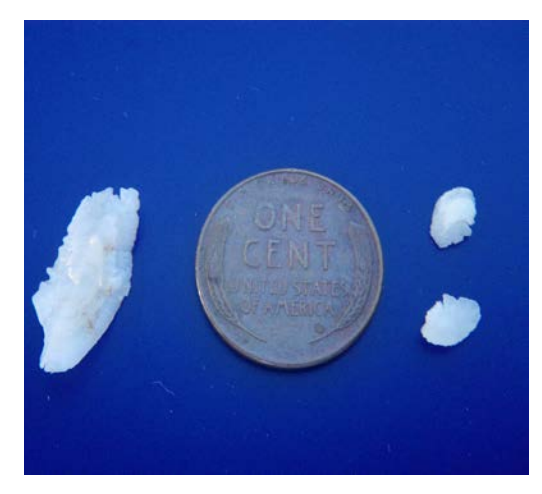
Blue Catfish otolith used for ageing in comparison with the much larger otolith for Striped Bass. There are three different types of otoliths in fish. Their main functions are for detecting sounds and gravitational force to assist with hearing and equilibrium.