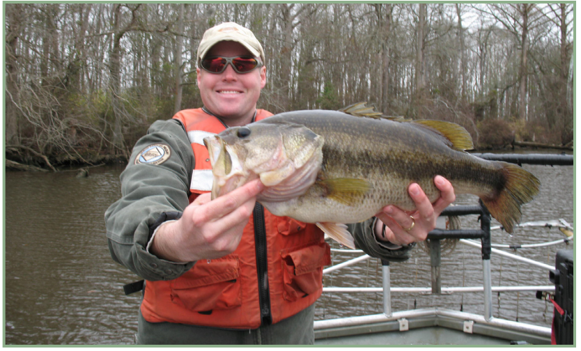
In coastal rivers where bass growth is slow, few fish will reach this size. However, improvements in growth rates and average size can be achieved using angler harvest as a management tool.

In any aquatic system, the absence of big bass can be the result of several factors. If you assume that big bass are old bass (sometimes true, but not always), then you might believe that mortality has removed the big bass from the population. This may be true in systems that experience high rates of angler harvest, excessive movement of tournament-caught bass, extremely toxic water quality, or rapid consumption of bass by other predators. In fact, high rates of bass harvest by anglers 30-plus years ago resulted in the need for harvest restrictions designed to protect bass long enough for them to grow to a quality size. The absence of big bass may also be related to growth patterns.