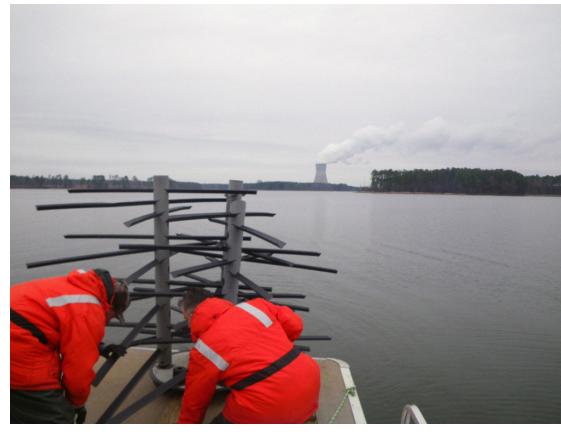
Figure 5: Example of fish attractors being placed into Harris Lake (NCWRC)