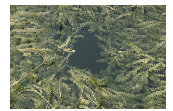
Figure 2. Hydrilla underwater