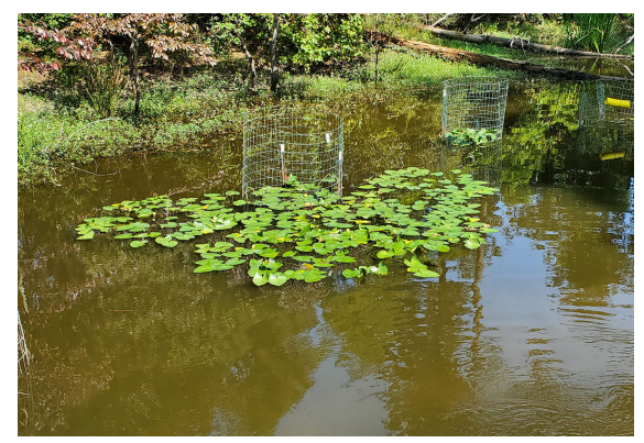
Figure 4: Example of a fenced exclosure to protect beneficial vegetation from herbivores