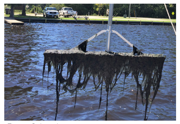
Figure 3: Lyngbya (Mark A. Heilman)

A Habitat Enhancement Plan was developed in 2018. All fish attractor sites and areas to restore aquatic vegetation were identified by the public. The plan is updated annually based on additional public input and work completed each year and can be found at: ncwildlife.org/HarrisLakeHabitatPlan