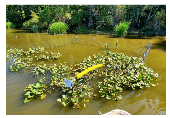
Figure 4a: Close-up view of a fenced exclosure to protect beneficial vegetation from herbivores (NCWRC)