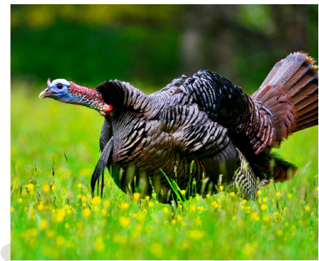
Eastern Wild Turkey (NWTF)

Two years, although some birds have lived up to 10 years.