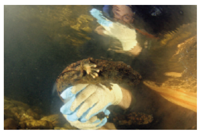
Hellbenders are declining in number throughout their range. Biologists continue to monitor the population and health of North Carolina's hellbenders in an effort to ensure the survival of these incredible salamanders for generations to come.

visiting the same few streams and lifting lots of big rocks can really damage the habitat," Humphries said. Hellbenders actually spend much time foraging in open water, and can be enjoyed without habitat damage, and with far less expended effort, by simply wading and looking. This can be particularly effective at night with a good light, but they may also be seen during the day, especially at sites with healthy populations. Polarized sunglasses help, and a Plexiglas-bottomed viewing bucket can facilitate spotting and photographing them underwater. Snorkeling with a mask is another good way to see them, along with numerous other underwater creatures. Once I even spotted a hellbender from a riverbank without even having to enter the water. Moving large rocks to look for them is probably justifiable only during focused surveys in streams where hellbenders are uncommon or unknown, and even then it should not be undertaken during breeding season.