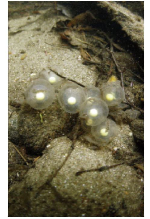
Female hellbenders lay 200-400 eggs in depressions created by adult males under large flat rocks in clear mountain streams. Once the eggs are fertilized, males will guard them for over two months until hatching.

"I'm glad a lot of folks are interested in seeing hellbenders in the wild, but repeatedly