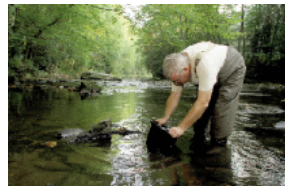
With their mottled brown coloration, hellbenders are able to blend in perfectly with the rocky substrate of a mountain stream. The author uses a clear Plexiglas viewing bucket to help find hellbenders resting on the bottom of a North Carolina river.

BUT EVEN HELLBENDER AWARENESS AND APPRECIATION CAN BE A DOUBLE-EDGED SWORD.... "FIELD HERPERS" (HERPETOLOGISTS) WHO MAY NOT NECESSARILY WANT TO COLLECT HELLBENDERS, BUT TOUCH AND PHOTOGRAPH THEM.