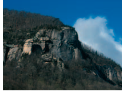
Peregrine falcons occupy a highaltitude niche, nesting on mountain cliffs.

The peregrine population in our state seemed to be well on its way by 1991. But the number of territorial pairs began decreasing