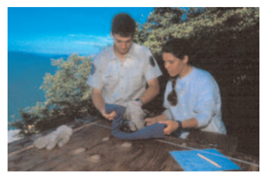
Commission biologists work high up North Carolina's mountains, checking nests for eggs or chicks, and occasionally examining an adult bird.

awareness of such closures. Commission biologists have coordinated with other public landowners like the U.S. Forest Service to reroute hiking trails near nesting sites in order to prevent human disturbance.