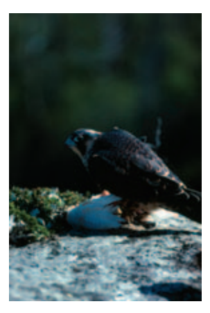
The peregrine falcon's amazing speed and agility enable it to prey on other birds.

Effective conservation management has successfully established a peregrine falcon population in western North Carolina. With continued efforts, the peregrine falcon population in our state will continue to rise. In 1999, the U.S. Fish & Wildlife Service removed the peregrine falcon from the federal Endangered Species list. However, the peregrine still remains protected under the North Carolina Endangered Species law and the Migratory Bird Treaty Act of 1918.