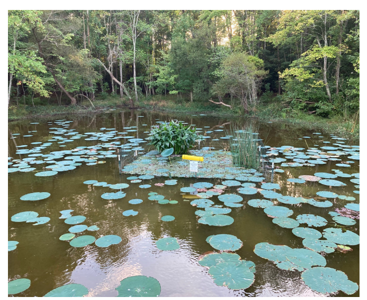
Figure 2. Fenced exclosure protecting beneficial native vegetation. Also shown is native vegetation growing outside of the exclosure that is less susceptible to herbivory.