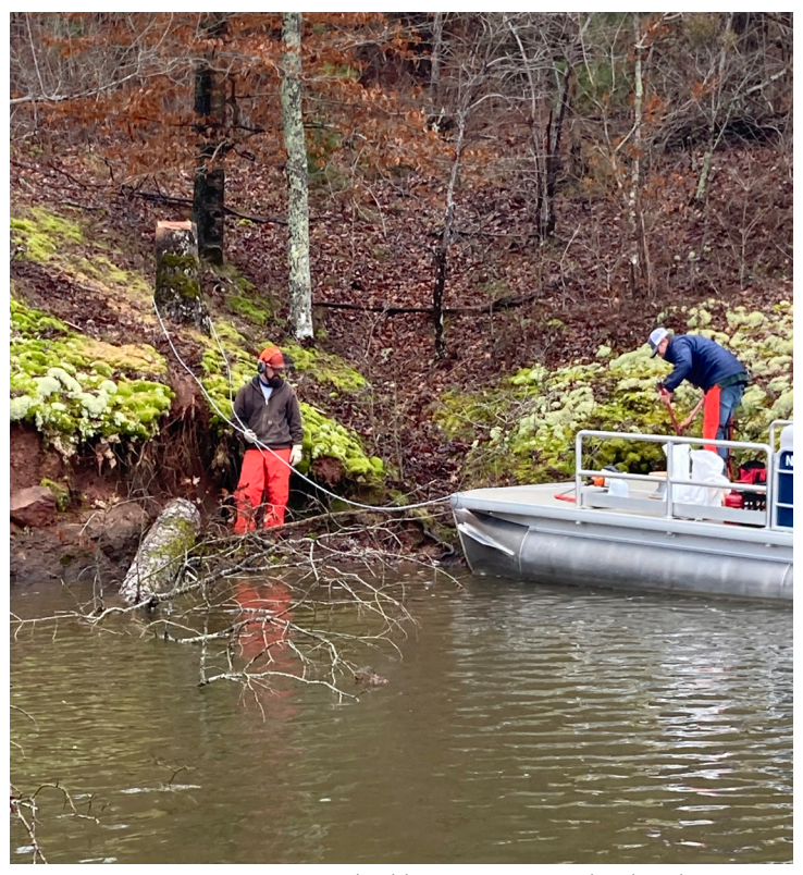
Figure 4. Commission personnel cabling a cut tree to the shoreline