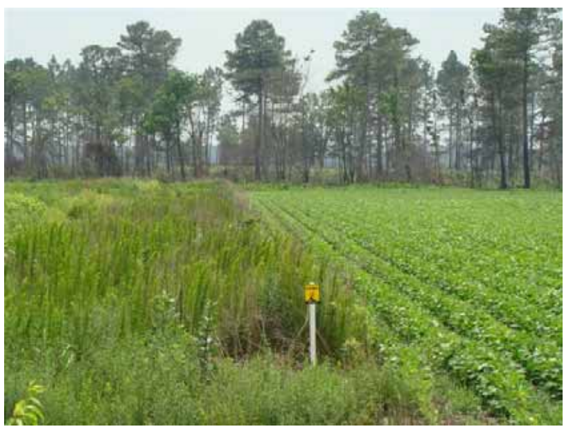
A field border and a thinned pine stand in the background.

ment Grants (EEG) designed to improve water quality while providing wildlife benefit. Initial habitat work included development of field borders (mostly 10 to 60-foot-wide linear strips of natural vegetation such as marestail, dog fennel, broomstraw, blackberry, sumac, smartweed and pokeberry), habitat areas (blocks of the same natural vegetation or planted in a mix of native warm season grasses and forbs), and areas of native warm season grasses. The grasses included switchgrass, little and big bluestem and indiangrass. Forbs used were primarily purple cone-